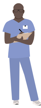
Occupational Therapy Ceil blue