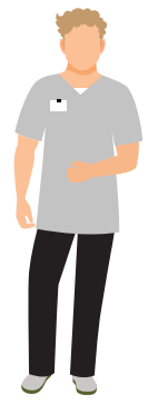
Patient Transportation Gray top with black bottom