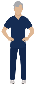
Physical Therapy Navy blue