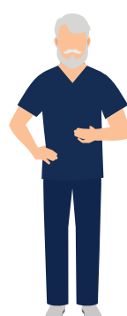
Radiation Therapy Navy blue